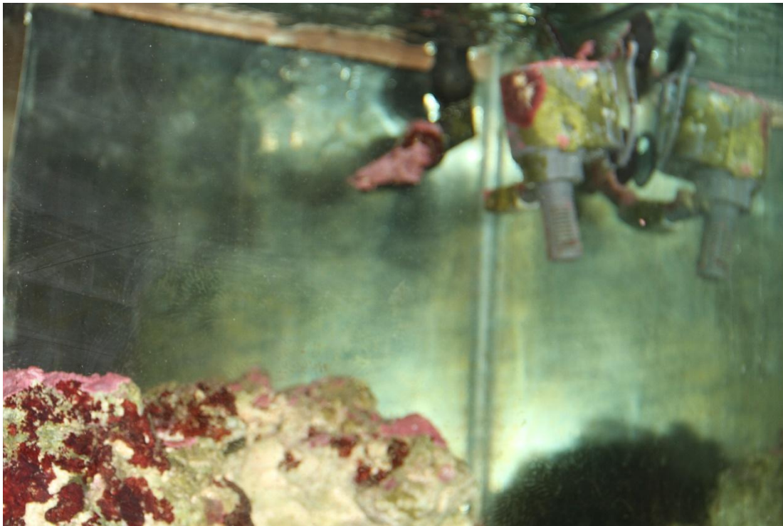
Right side of medium tank showing pump return and power head (water flow pump)