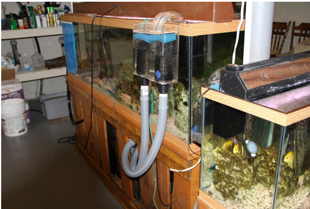
Back of medium tank and side/back of small tank. Overflow box is shown (I modified to make it quieter).