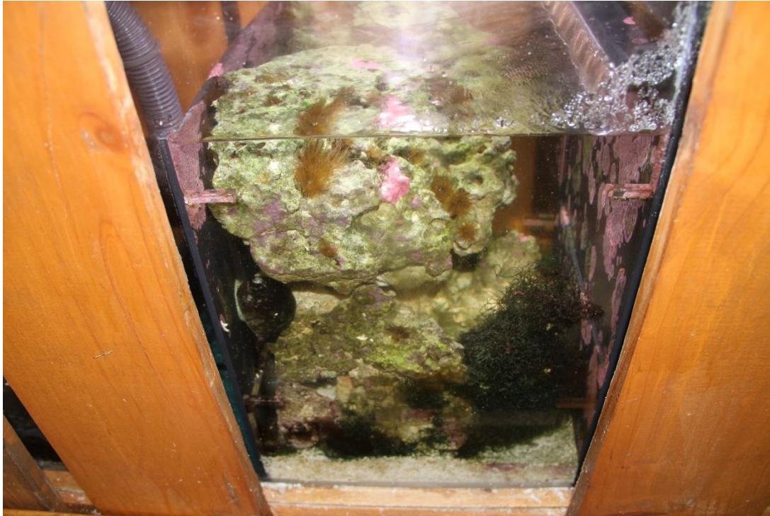
Center (2 nd ) refugium compartment from the back