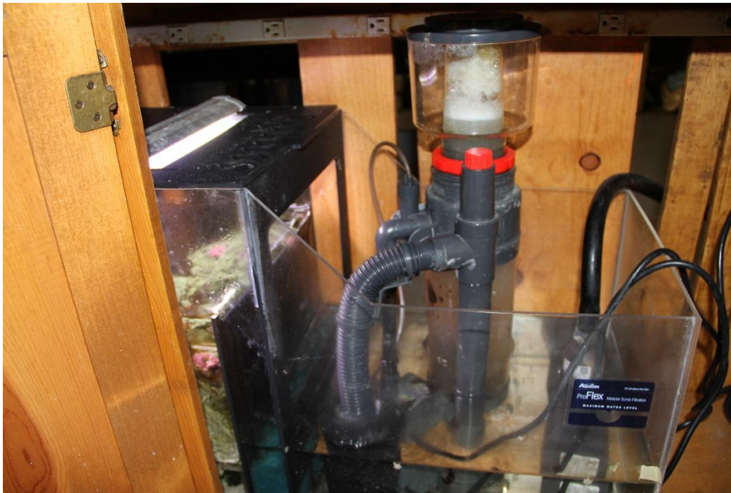
3 rd Sump compartment contains the protein skimmer and return pump