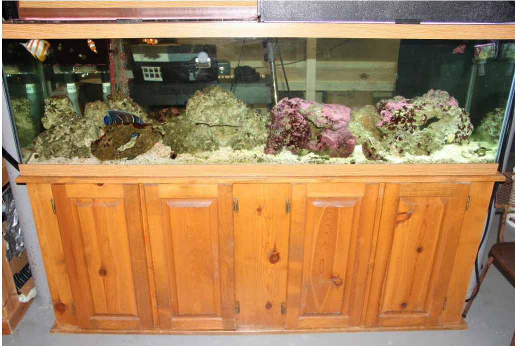
Medium 125-gallon Tank: