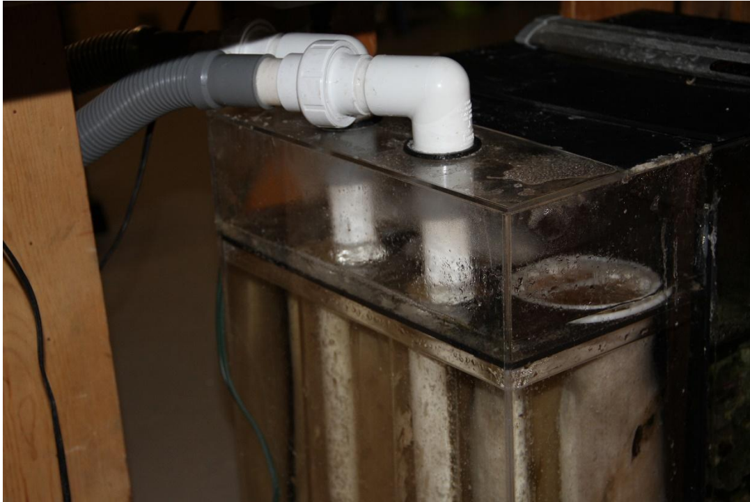
1 st sump compartment holds 3 filter socks